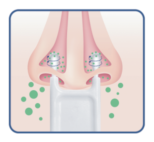
Step 1: Clean